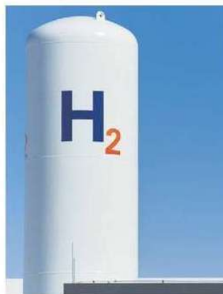
NGEL is looking for JVs with HPCL and Hindalco. BLOOMBERG

and Hindalco remained unanswered till press time.