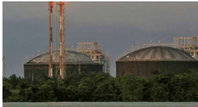
LOOKING UP. Overall gas consumption across the globe is seen increasing by 2.5 per cent in 2024

Europe's fuel usage is forecast to grow by 3 per cent year-on-year, but that would still be way below the levels before the energy